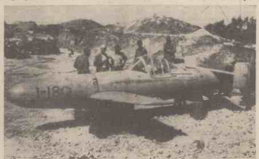
This "Baka" 'plane was found on Yontan airfield, Okinawa. Its capture may have saved an Allied warship—certainly the life of a Jap.

A remarkably small 'plane to be piloted, the "Baka" was only 19ft. 10in. long. Its low aspect ratio wings were 16ft. 5in. in span, and the tail span 7ft. 1in. The fuselage was well streamlined, and the pilot was accommodated about two-thirds from the nose. His cockpit embodied a clear-view hood, which appeared large in comparison with the rest of the machine, of comparison with the rest of the machine, of all-metal construction, the body structure having a covering of thin gauge light alloy. In the nosing was a 1,200lb. charge of tri-nitro-anisol explosive, and behind the pilot three dry-fuel rocket units, which propelled the "Baka" in its final "death-dive" at a maximum speed of