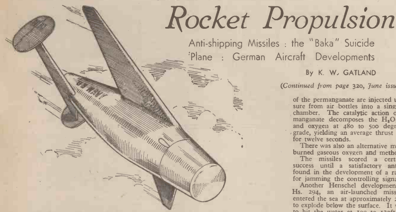
Fig. 73.—The "Bat." This was the first and only missile of the war to incorporate a radar "self-directing" scanner.

LTHOUGH it must be admitted that many of America's guided missiles were based on German research, the Germans by no means had the monopoly of