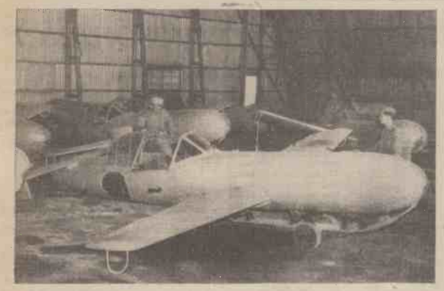
A corner of a hangar at the Yokosuka Naval Air Station, Japan, where the Kamikaze pilots underwent their training. The machines in this picture are all trainer versions of the notorious "Baka," having ballast in place of H.E., and fitted with landing skids.

ceeded in the development of an improved motor in which the effective life of the heating substance had been almost doubled, simply by incorporating liquid fuel sprays above the carbons. The fuel tank was to be built within the single vertical fin.