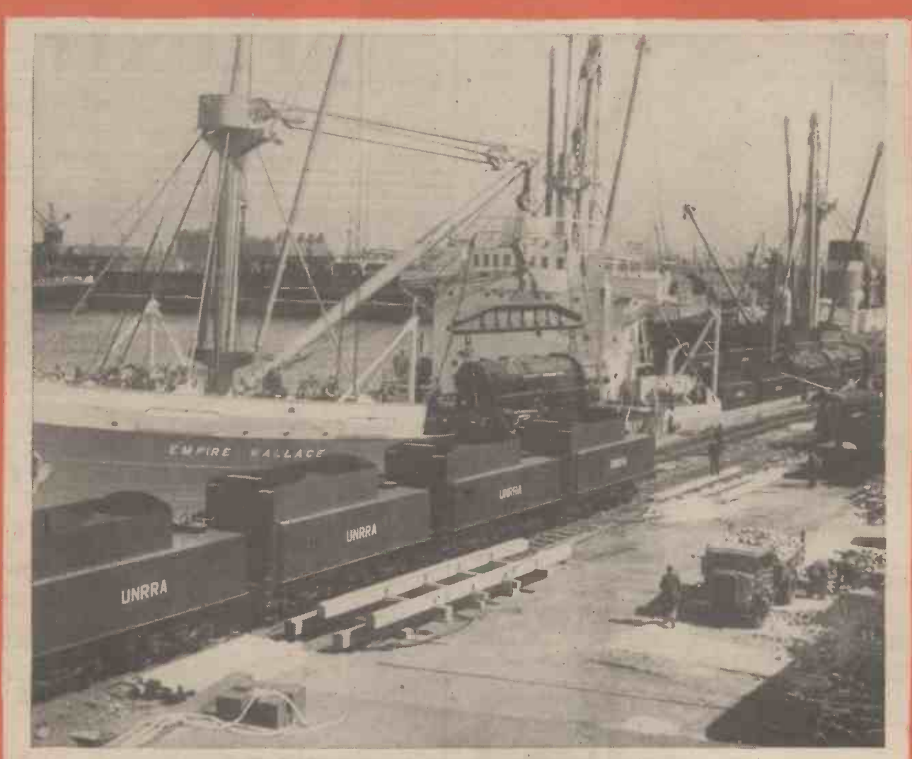
A BUSY SCENE AT LIVERPOOL DOCKS (See page 367)